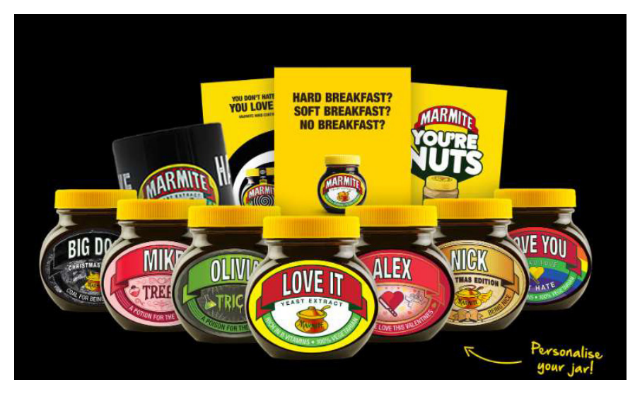
FIG 5: personalized product for gifting can attract a significant premium ^{12}

The most famous campaign for 'personalized' labels was Coca-Cola's "Share a Coke", but in practice most labels were printed in long runs, randomizing the most common names in each country; only labels from roadshows and purchases from the web were actually printed on demand for specific recipients. This makes it an excellent example of a hybrid model taking advantage of the benefits of multiple print technologies.