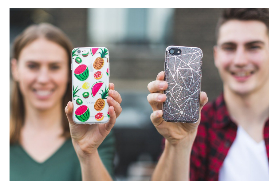
FIG 6: demand for customized product is not restricted to any particular age group

A lot of the demand for this mass customization is ascribed to the changing attitudes and communication preferences of millennials and Gen-Z. To generalize, it's often said that such audiences demand to be treated, and be able to represent themselves as unique, requiring them to be able to obtain unique product in support of that position.