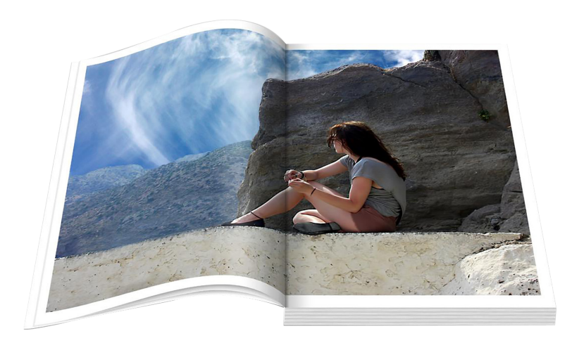
FIG 4: photobooks offer higher margins than simple print finishing

Each individual order, perhaps for one mug with a photo printed on it, may not appear to be variable data printing. But when orders are aggregated at the producer there may be hundreds or thousands of mugs to be printed per day, each with a different image.